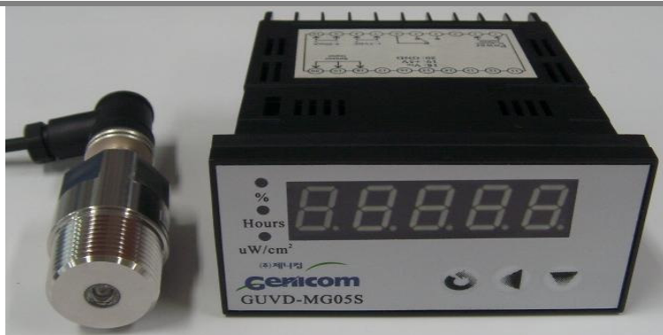
Fig. 1 UV Radiometer 5.0 (Size of Display : 97 × 50 × 112mm)