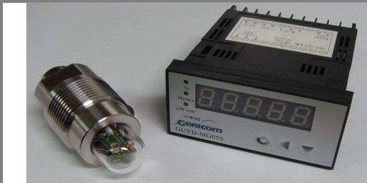
Fig. 1 UV Radiometer 5.0 (Size of Display : 96 × 48 × 112mm 3 )